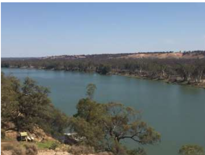
The view from Riverglen Art Studio