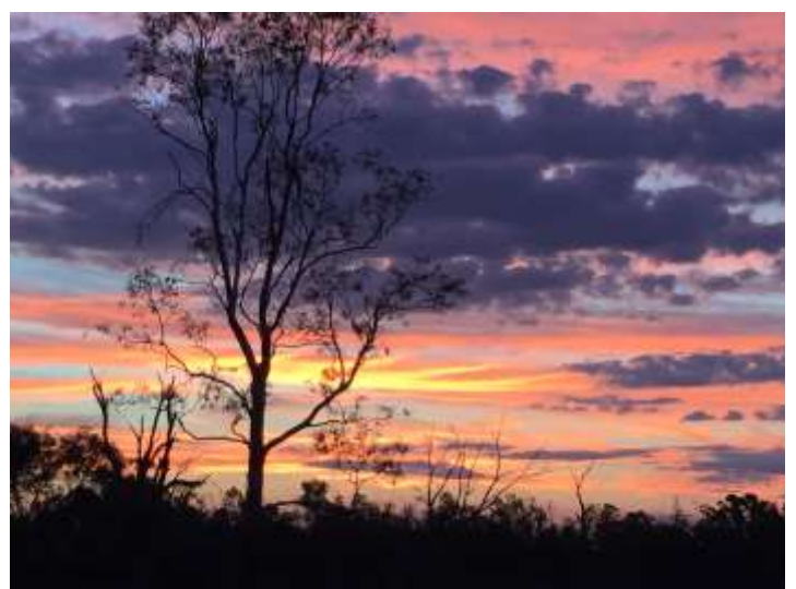
Another beautiful sunset in the Riverland.